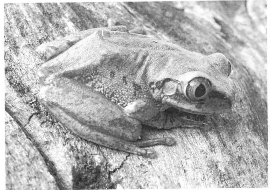
Fig. 1. Leptopelis natalensis from Kosi Bay, Zululand.