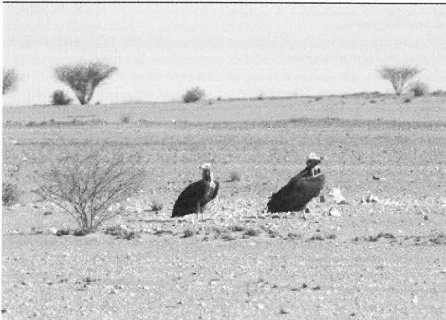
Fig. 1. Vultures preying on Uromastix .