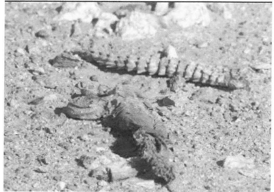
Fig. 2. Uromastix preyed upon by vultures.