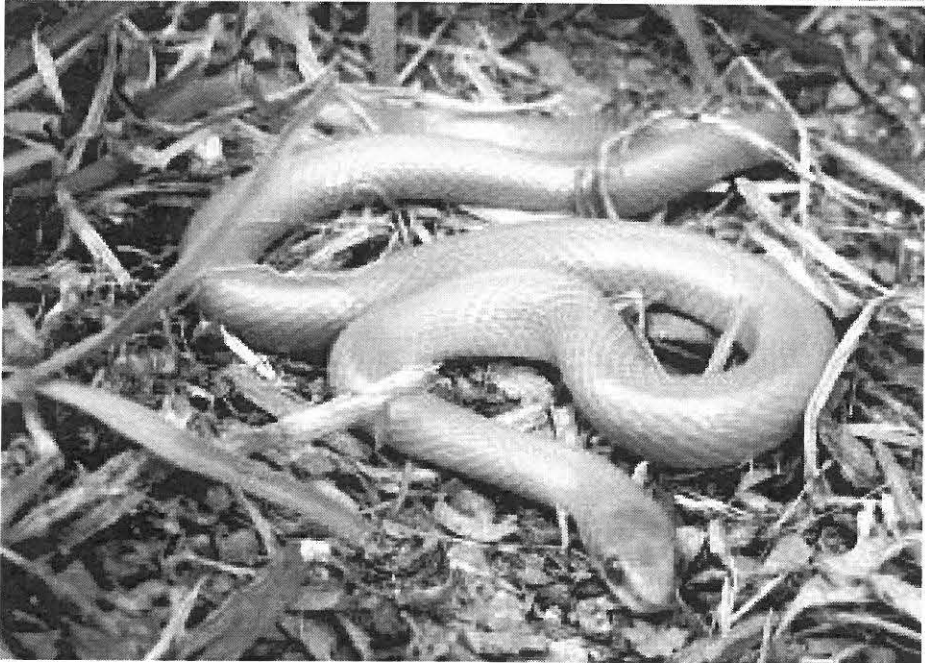
Figs. 1 and 2. Lamprophis fuscus from Kuils River.