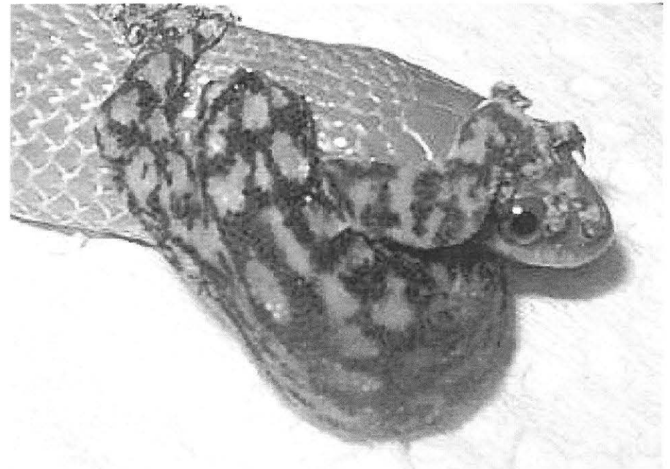
Fig. 3. Lamprophis fuscus consuming an Afrogecko porphyreus .