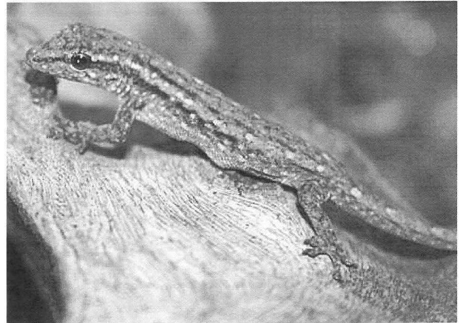
Fig. 1. Lycodactylus c. capensis from Joostenbergvlakke, Western Cape.

A single specimen with a total length of 168.1 mm (SVL 144.8 mm; T 23.3 mm) was collected on 17 April 2008. The specimen was in the process of being killed on the school soccer field when it was collected. It had 194 body annuli and 44 caudal annuli. The dorsal colouration was brownish-olive with a purple sheen. The specimen was examined under a binocular microscope and only a single postocular and single temporal were evident. The specimen has been deposited in the Transvaal Museum (TM 85586).