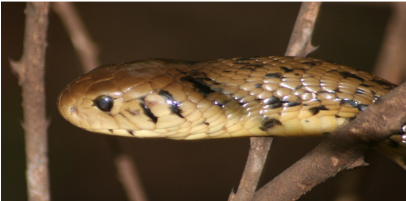
Fig. 1: Head photograph of Naja melanoleuca from Pafuri Camp, Kruger National Park, Limpopo Province, South Africa.

Naja melanoleuca has been observed on two further occasions at the above locality, once on the 3 of March 2008, feeding on an anuran species, and again on 9 April 2008. These records represent the first for Naja melanoleuca in the Kruger National Park, and the first records for Limpopo Province, South Africa.