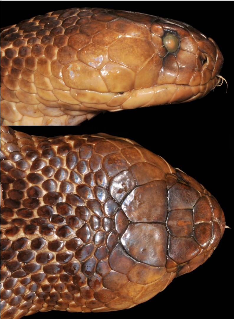
Fig. 1: Lateral and dorsal aspects of the head of the second Tanzanian specimen of Naja ashei .