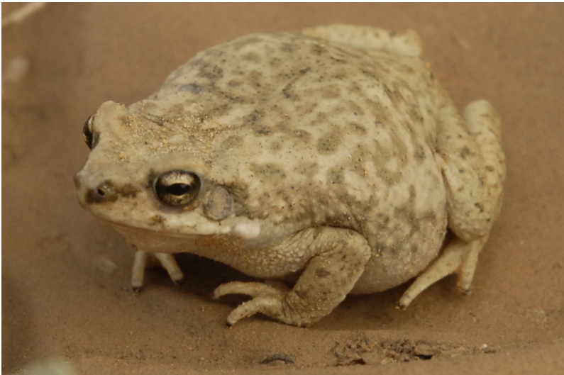
Fig. 1: Bufo dhufarensis from the Ibex reserve, Saudi Arabia.

Saudi Arabia, Plateau, head drainage of Shaib al Ajma (Wadi Mutim system), Ibex Reserve (ca. 250km southeast of Riyadh, N 23.48° E 46.49° & app. 1100 m.a.s.l.). Drainage line with temporary water flow after heavy rainfall in May 2010, on Jurassic limestone Plateau. Observed by Torsten Wronski. Verified by Peter Cunningham. 1 specimen – photographed (Fig. 1).