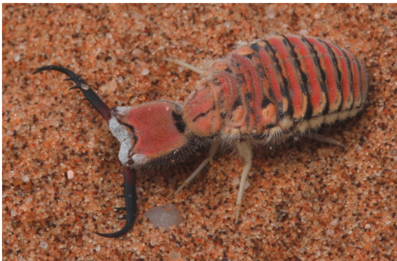
Fig. 1: Palpares immensus (Nuroptera: Myrmeleontidae) measuring 33.4 mm in length.

Considering the respective sizes and weights of the antlion and the adder, it seems unlikely that the snake would be a regularly selected prey item. It is likely that the antlion had bitten the snake accidentally and could not release its grip (M. Mansell, Pers. Comm. ). The snake showed a circular torn out area of skin 2 mm in diameter approximately eight ventral scales ahead of the heart. This injury was likely caused by the large mandibular teeth. The snake also showed localized internal haemorrhagic discoloration approximately 15 mm down the left side of the body at the same site suggesting a systemic effect of the venom. The events in this account occurred close to a dollar bush ( Zygophyllum stapffii ) and the assumption is that the initial contact between insect and snake took place under the bush and was probably accidental.