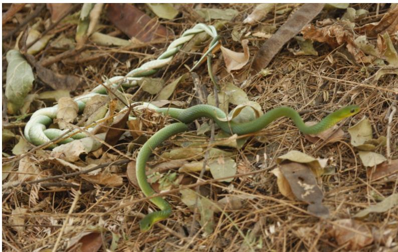
Fig. 1: Two male Philothamnus hoplogaster engaged in combat on Kapinga Island, Kafue National Park, Zambia.

On 27 October 2010 male combat was observed between two South-eastern Green Snakes ( Philothamnus hoplogaster ) on Kapinga Island, situated in the Busanga Plains of Kafue National Park, Kafue, Zambia. The two snakes had their posterior halves very tightly twisted (Fig. 1). The observation lasted a few minutes, after which the snakes untangled and quickly disappeared into the leaf litter. To our knowledge, this observation represents the first report of male combat in the genus Philothamnus .