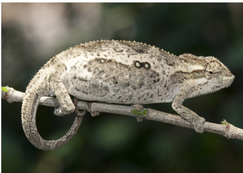
Bradypodion melanocephalum from Durban North, KwaZulu-Natal, South Africa. Photograph by Johan Marais (EOS 1D Mark III, 1/80, F9, ISO 200)