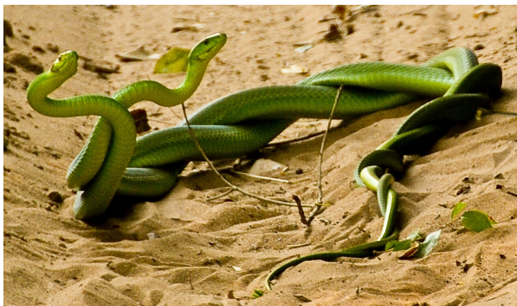
Fig. 1: Two male Dendroaspis angusticeps engaged in combat near Lake Sibaya, KwaZulu-Natal, South Africa.

On 14 June 2010 at 10:20, two male Green Mambas ( D. angusticeps ) were observed in combat on a sand track next to Lake Sibiya in northern KwaZulu-Natal (Fig. 1). The track crossed through thick coastal forest. The bodies of the two snakes were loosely intertwined and with each male trying to push down the neck of its opponent. The individuals did not appear to show overt aggression to one another, and the combat appeared to be entirely ritualistic. As the observers drove closer, after watching the snakes for approximately 5 minutes, the snakes moved off into the bush.