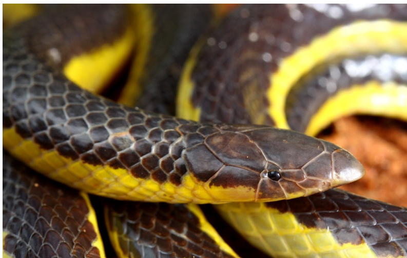
Xenocalamus bicolor bicolor from Steenbokpan, Limpopo Province, South Africa. (EOS 50D, 1/125, F10, ISO 400)