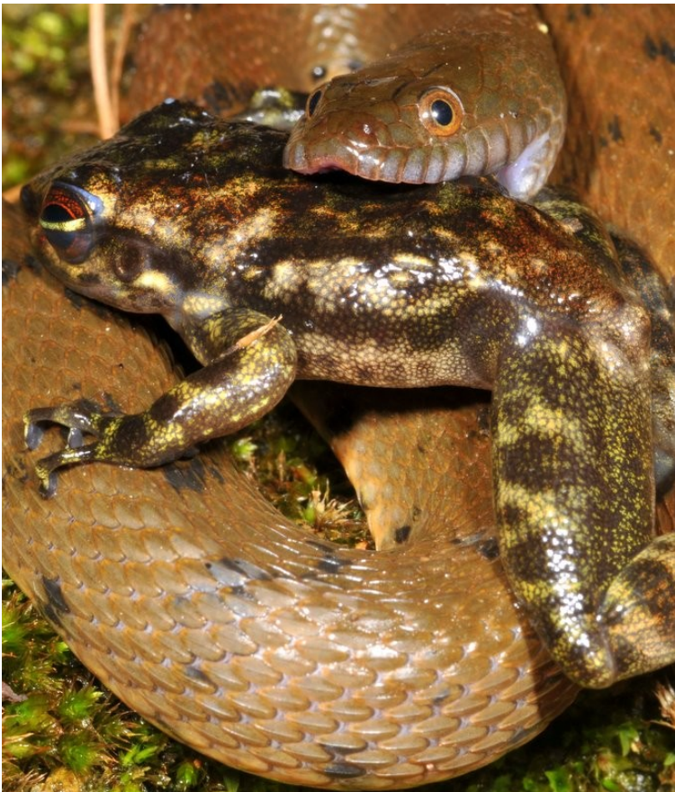
The West African water snake ( Afronatrix anascopus ) feeding on the Cascade Frog ( Petropedetes natator ); Etke Stream, Grassfields region, Mt Nimba region, Liberia; 07°29'06.3"N, 008°34'38.2"W, 508m).