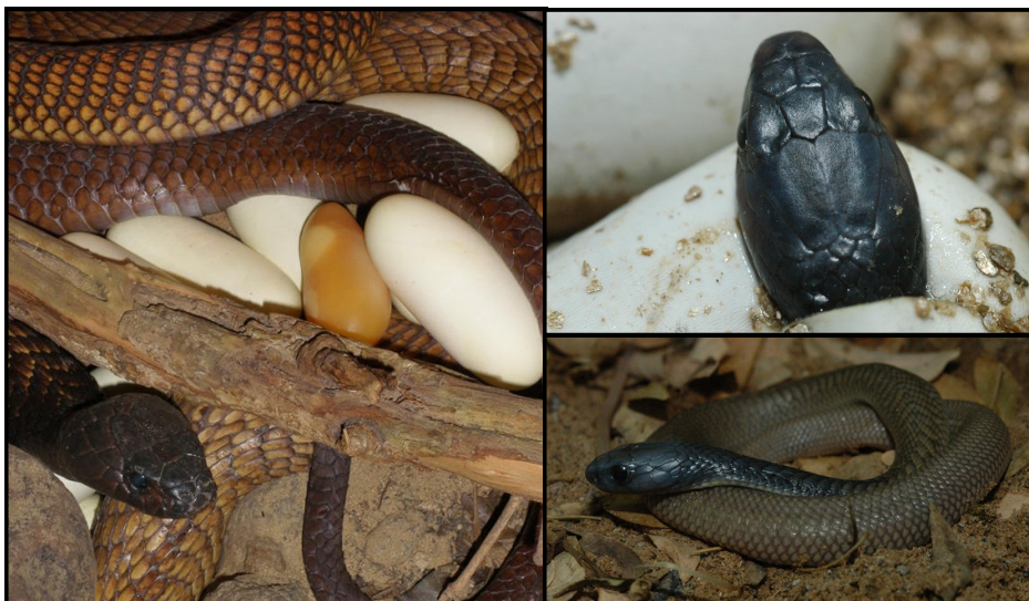
Figure 1: Female Naja arabica with eggs (left), hatching N. arabica (top right), and juvenile N. arabica prior to first ecdysis (bottom right).