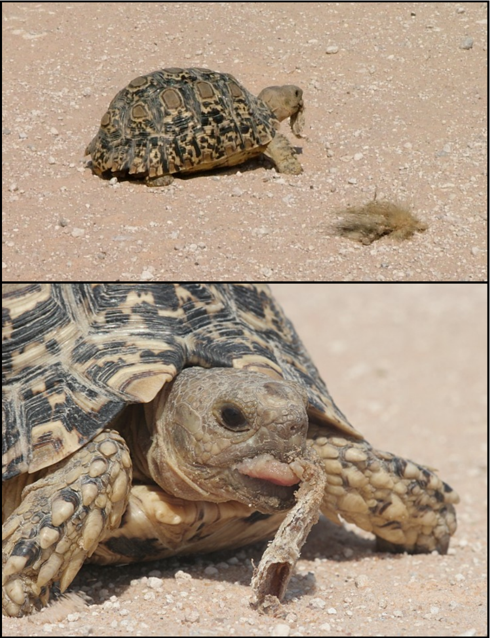
Figure 1: A Leopard Tortoise ( Stigmochelys pardalis ) feeding on the remains of a Bat-eared Fox ( Otocyon megalotis ) in the Northern Cape Province