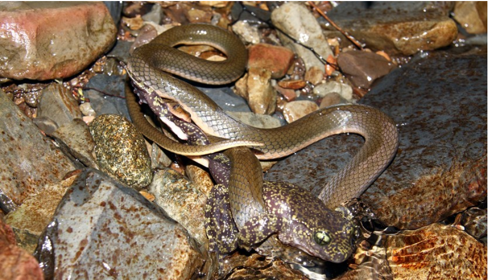
Figure 1: Lycodonomorphus rufulus (WRS R-736) with Hadromophryne natalensis (WRS A-244) in its jaws. Long Tom Pass, Mpumalanga, South Africa.

and fig. 187, 188 and 189; Broadley, 1990, p. 77 and Branch, 1998, p. 73), I can find no reference to this species feeding on heleophrynid amphibians. The six currently recognised species of Heleophryne and Hadromophryne natalensis (Family: Heleophrynidae) all fall within the geographical range of Lycodonomorphus rufulus and may form part of the natural diet of this snake. It is also interesting to note that this predominantly nocturnal species was hunting in the late afternoon in cold, fast-flowing water.