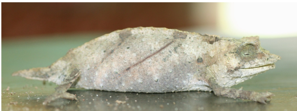
Figure 1: Rhampholeon (Rhinodigitum) boulengeri (Steindachner, 1911) from Budongo Forest, Uganda.

On July 19th 2010, a pygmy chamaeleon was observed and photographed at the Budongo Conservation Field Station (Fig. 1). Consulting Spawls et al. (2004) and various recent treatments on pygmy chamaeleon taxonomy (Menegon et al. 2002, Mariaux & Tilbury 2006); it was subsequently identified as a Boulenger's pygmy chamaeleon; Rhampholeon (Rhinodigitum) boulengeri (Steindachner, 1911). No voucher specimens were collected, however, as the necessary permits were not in order.